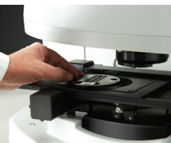
Eject button and Slide-View of OMNIC Picta allow simple and fast sample loading